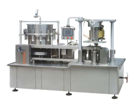
Post fill sterilization / cooling