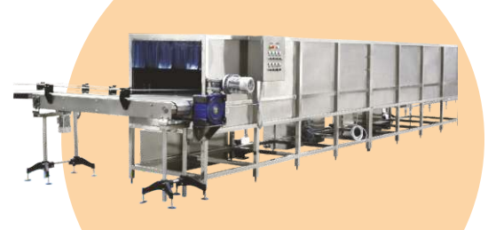
For juice in PET bottles